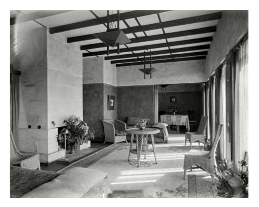
Interior view of living room of the Grant House, Castlecrag, c1922

Walter Burley Griffin and Marion Mahony Griffin, Castlecrag, 27 July 1930