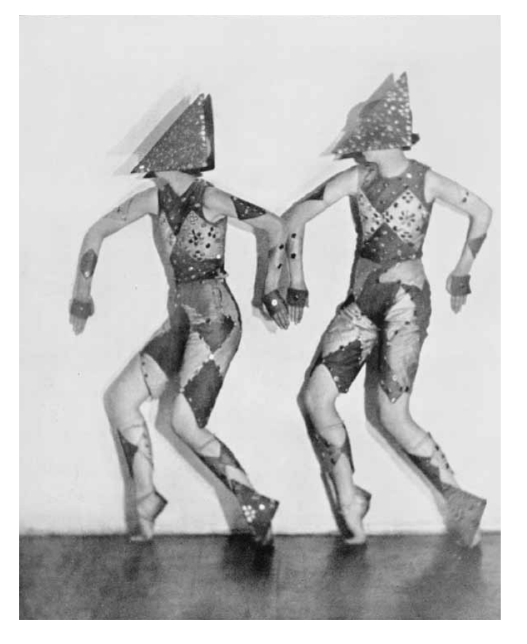
Monte Luke The dancers, The Home , September 1921 AGNSW Archive

Alison Rehfisch Negroid ballet late 1920s <sup>linocut</sup> AGNSW