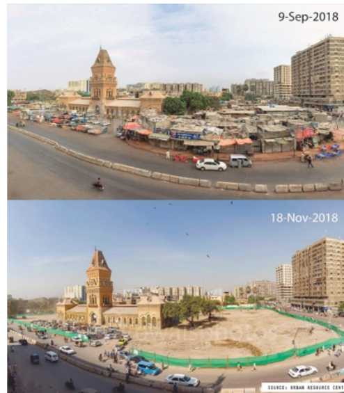
Before and after demolition of 'encroachments'

dancers in the Frere Hall gardens. More recently, such space has formally been provided in a park in Sector 11-B of North Karachi, which has been taken over by Habib Bank Limited under the 'Adopt a Park' Scheme.