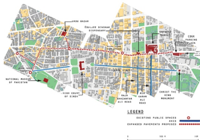
The map shows the proposed walkway linking the hawkers' market to Empress Market and continuing to the Burnes Road food street and Pakistan Chowk