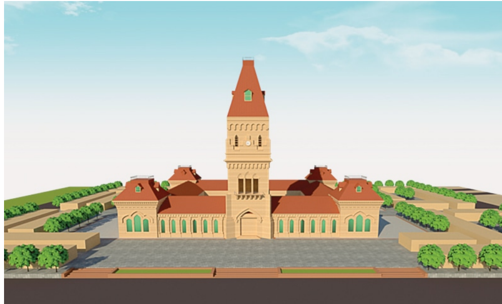
Front view of Empress Market

Estimates vary. However, the figure most quoted is that 1,700 shops were demolished, of which 1,200 were either leased or were paying rent to the Karachi Metropolitan Corporation. Inside the market, 93 butchers' shops were also destroyed although they were not encroachers. In addition, fruit and vegetable markets were removed from the pavements and so were approximately 3,000 push-cart hawkers. These figures do not include mobile hawkers and those who spread out cloth on the ground and placed their wares on it. It also does not include the musicians and performers who entertained the commuting public, nor the beggars who extracted charity from the visitors. Surveys by NED University students of development studies and the Karachi Urban Resource Centre have established that over 200,000 persons lost their jobs due to the demolitions. These include suppliers of manufactured goods, meat and vegetables; employees of the various businesses; porters, solid-waste collectors, chowkidaars, and 20-30 Hindu women who sold spices on the roadside like their parents and grandparents had done before them.